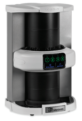
ScanX Classic Part No. F3700T

Registration : provided on the User Information Folder.