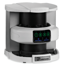
ScanX Intraoral Part No. F3600T